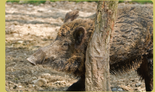
Tree and post rubs – Wild pigs will use trees, posts, and fences to scrape off excess mud or dirt after wallowing.