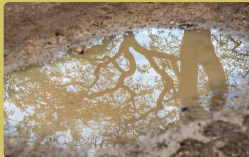
Wallows – These are wetland depressions wild pigs make to coat themselves in mud, damaging surrounding habitats.