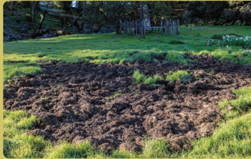
Rooting – This includes plants and crops.

Wild pigs come in different sizes and colours, but are mostly brown or black with coarse, bristly hair. They can grow 3 feet high and 5 feet long. Males typically have larger heads and tusks.