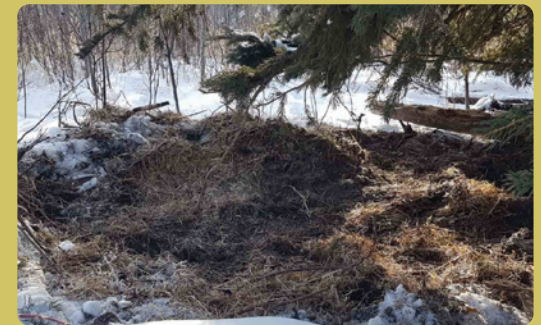
Nests or beds – Groups of wild pigs build habitats out of cattails and other wetland grasses.