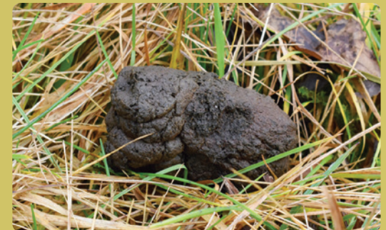
“Scat” – Wild pig feces resembles that of dogs and may contain acorns, grains, animal hair, or feathers.