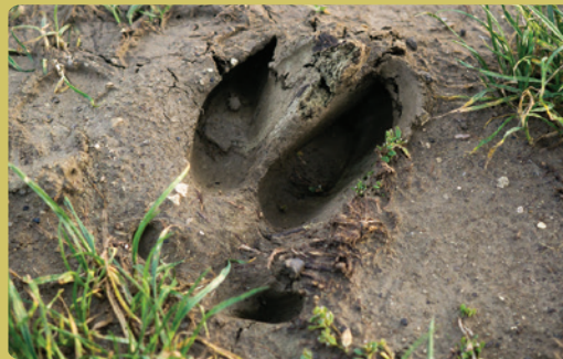
Tracks – Rounded, blunt-toed tracks appear in mud patches and wet soil and are often mistaken for deer tracks.